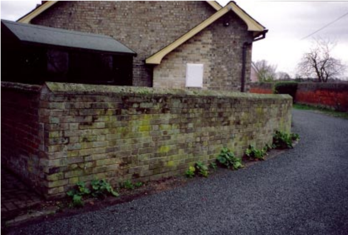
Suffolk white brick wall approximately. 7 metres long, between No. 10 and The Almshouses (Nos. 12-16).