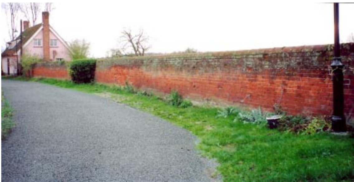
Red brick wall for 41 metres, approximately, between No. 1 and No. 15. Possibly contemporary with the building of No. 1.