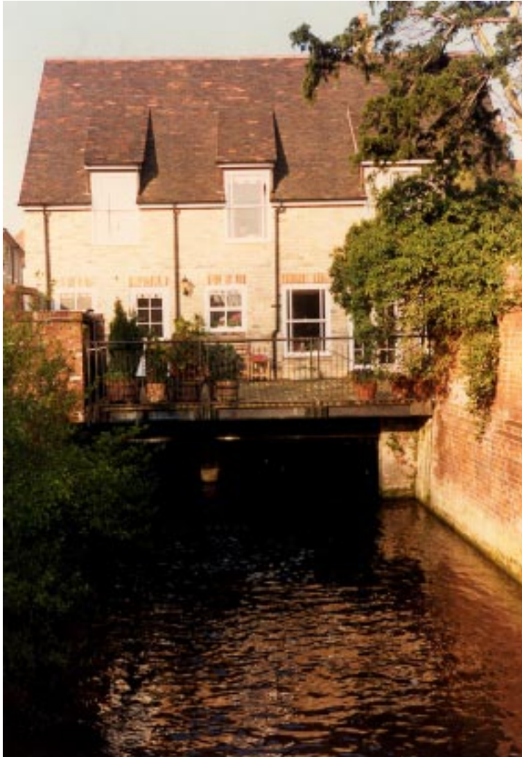
View from bridge over Mill Lade.